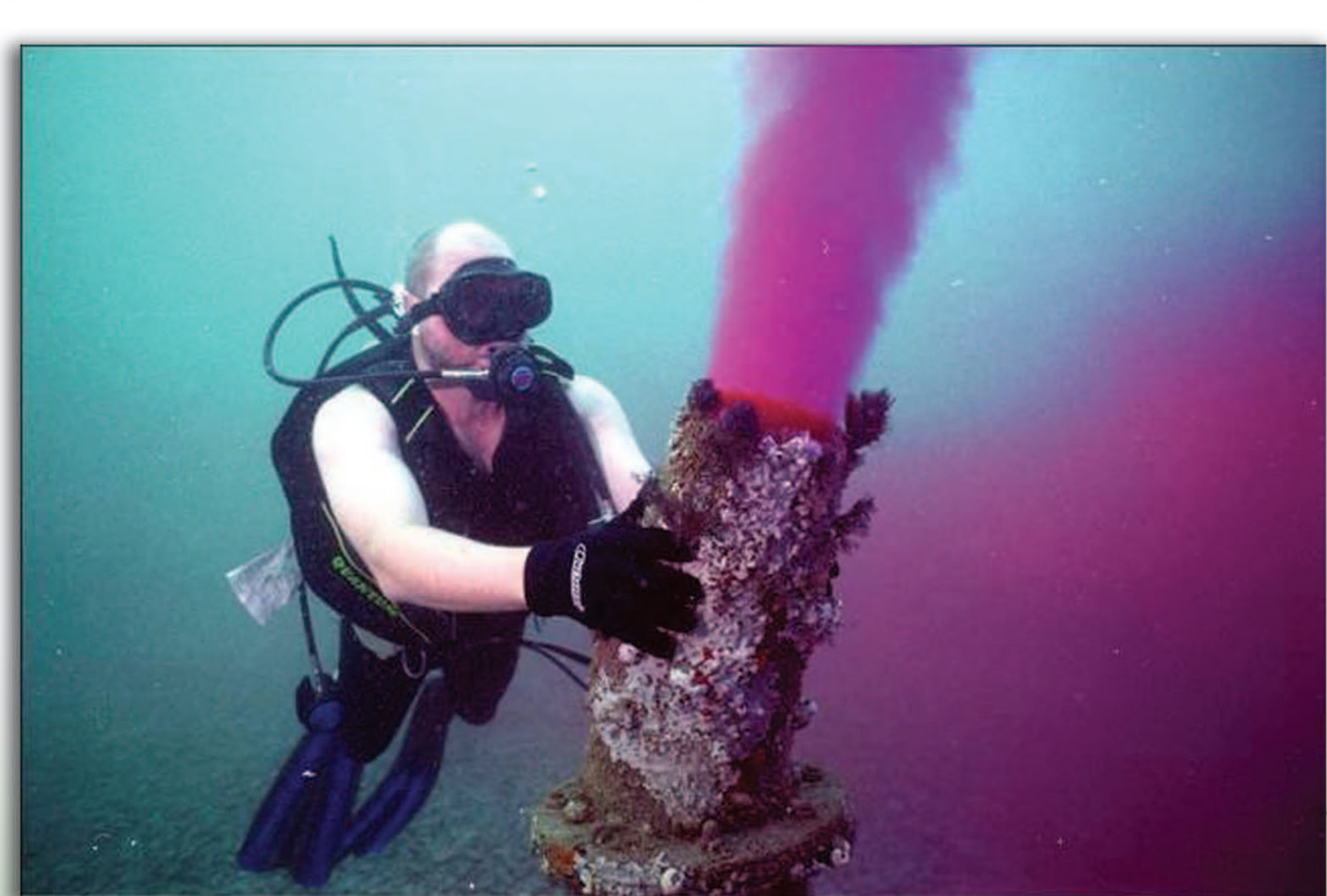
Dye tests being done on the Brine Discharge Ports